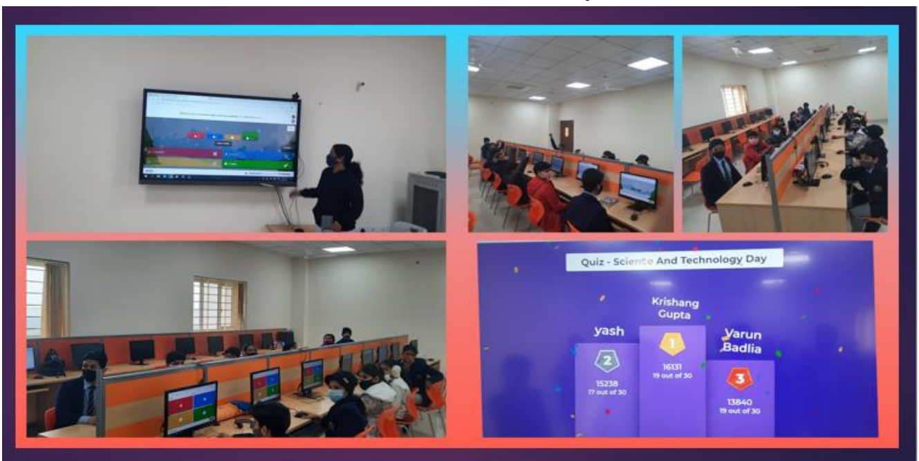
Science and Technology Quiz