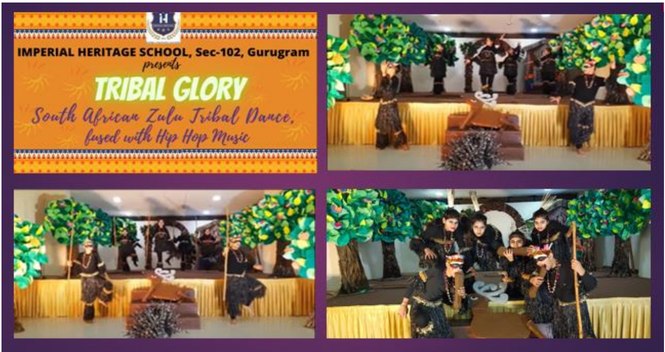
Maadhyam- Event: Tribal Glory