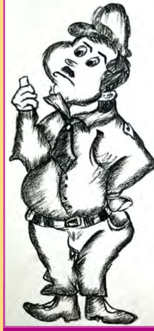
JIGYASA, VIII, Modern Era Convent B-1, Janakpuri